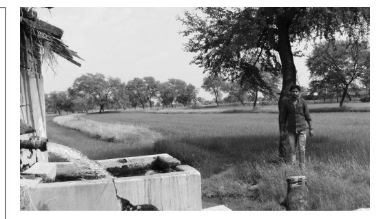
Improving livelihood of traditional farmer through crop loans

Having improved income levels, the family has now purchased additional land, started new business which involves purchase of paddy and wheat from small farmers, and supply of these crops in bulk to buyers. His family now enjoys an elevated social status within the community.