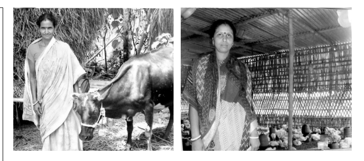
Collateral free micro loans offered to women helped to improve overall household income

Agri loans offered to farmers against their produce to meet working capital requirement helped to improve income levels