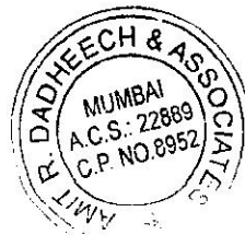
Amit R. Dadheech ACS No. 22889; COP No. 8952