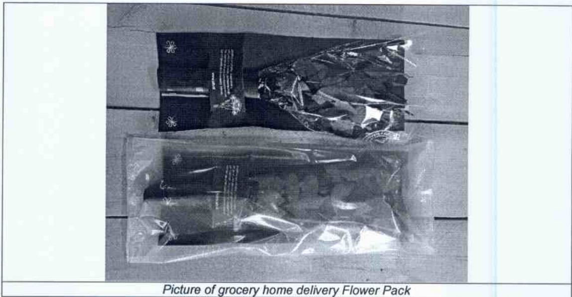
Picture of grocery home delivery Flower Pack