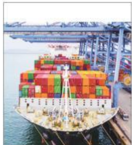
Toy exports have increased by 61% to $326.6 million in 2022 from $202 million in 2019. India exports toys to 100 countries

Apart from the quality control order of 2021, to curb imports and support the manufacturing of toys, the government had increased basic custom duty to 66% from 22% in 2020-21. In