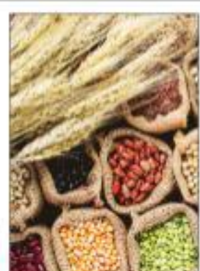
including Jute & mesta, Sown area as on July 7, 35.3 million hectare (MH) against average kharif (June-Sept) sown area of 109 MH

nut and sunflower have declined by 23.9%, 25.8% and 14.3% respectively on year so far. The sowing of cotton, a cash crop, is around 10.8% less than a year ago.