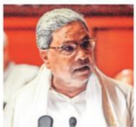
Karnataka chief minister Siddaramaiah on Friday

"Through our five guarantees, in a year, approximately ₹52,000 crore will be spent and