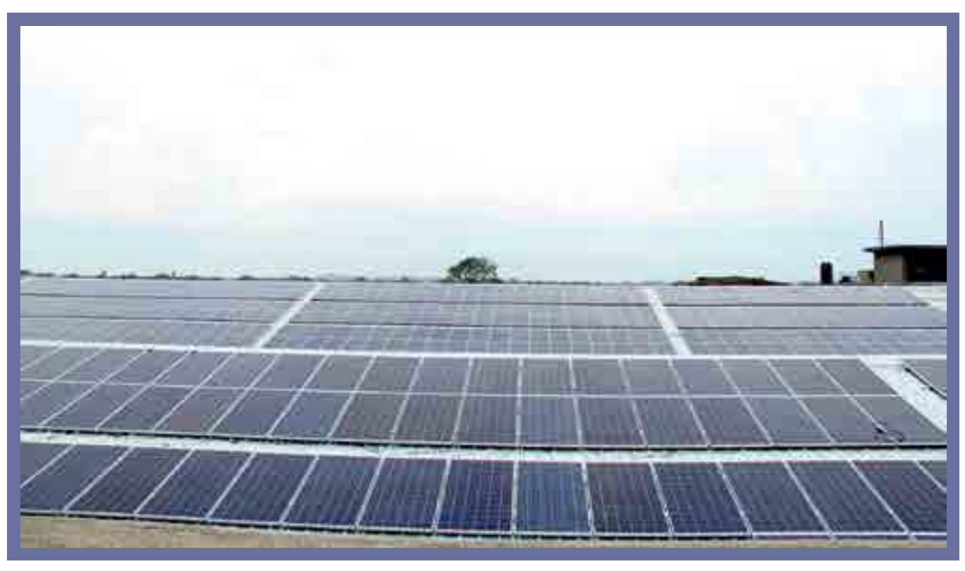
2.5 MW Roof-top Solar Power Generation Project installed at existing site Mandpam, Bhilwara