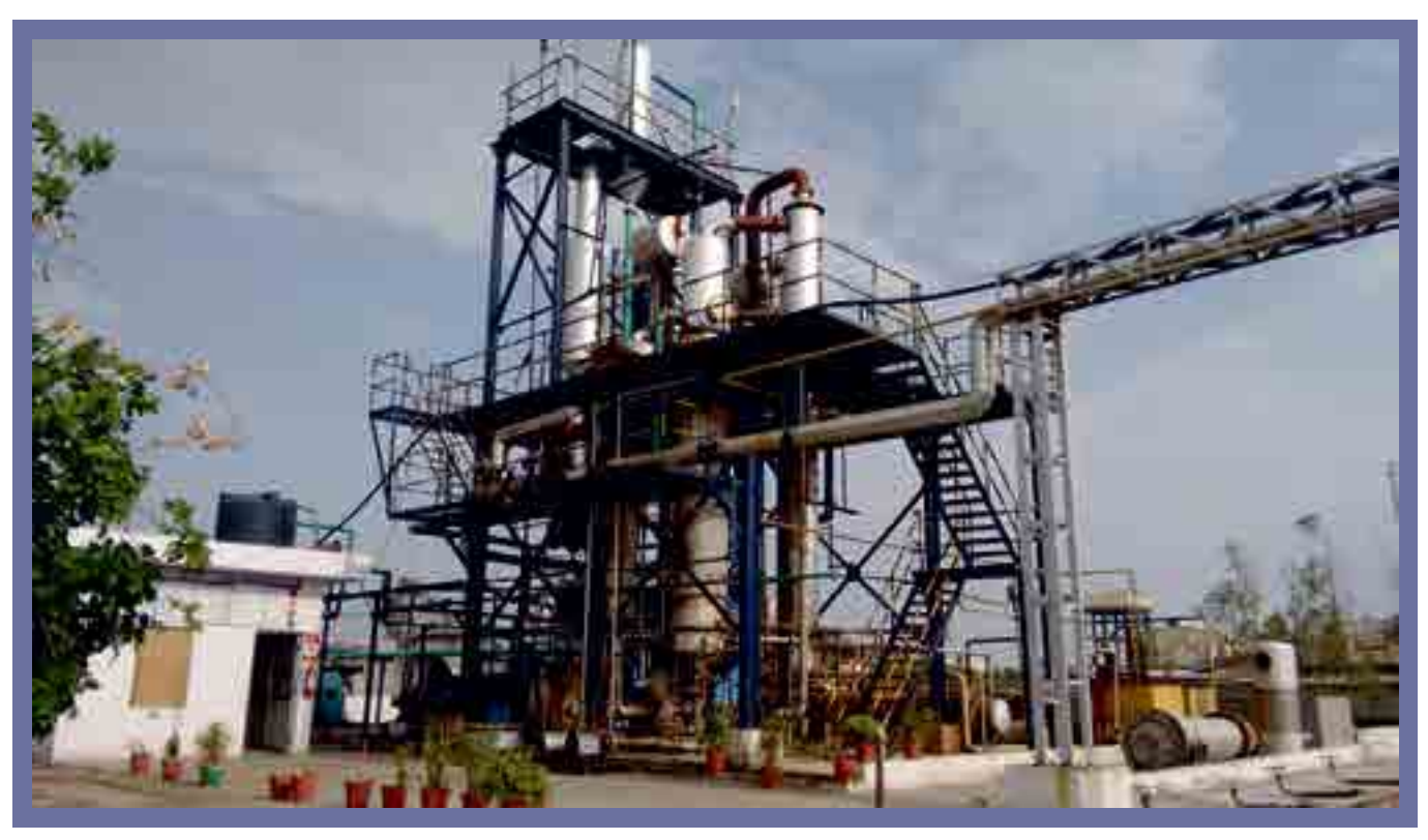
Zero Liquid Discharge Plant installed at processing division site at Mandpam, Bhilwara