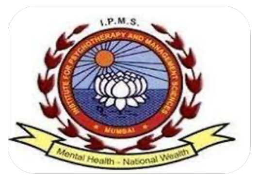
MSc in Psychology