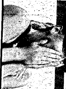
SPORTS Sharapova stuns Simona on emotional return P13