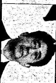
GLOBAL N Korea fires ballistic missile over Japan P7