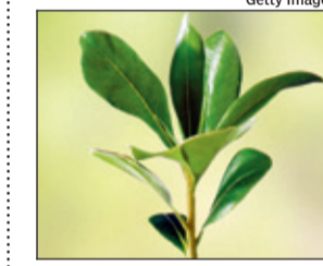
Bionic leaf 2.0 uses solar energy to split water molecules and hydrogen-eating bacteria to produce liquid fuels