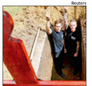
DIG IT UP: Hungarians take part in a grave digging championship in Debrecen on Friday

Dogs may have been domesticated not once, as widely believed, but twice, say scientists who found that man's best friend may have emerged independently from two separate wolf populations. Some scholars argue that humans first domesticated wolves in Europe, while others claim this happened in Central Asia or China. Researchers reconstructed the evolutionary history of dogs by first sequencing the genome of a 4,800-year-old medium-sized dog from bone excavated from Ireland. The team obtained mitochondrial DNA from 59 ancient dogs living between 14,000 to 3,000 years ago and then compared