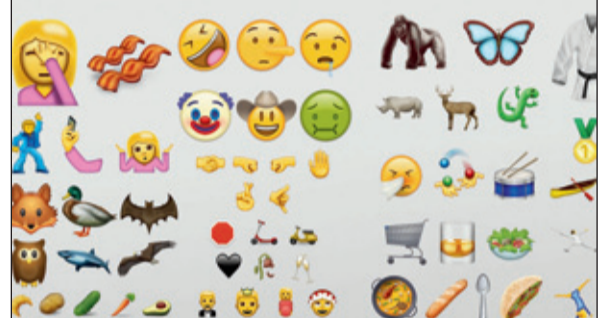
Mock-ups of the 72 new emoji slated for release in Unicode 9.0