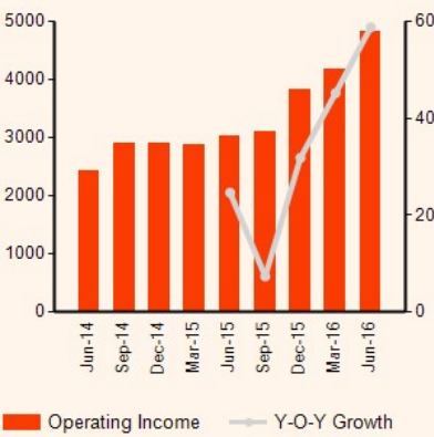
Operating Income and Y-O-Y Growth (Rs mn) (%)