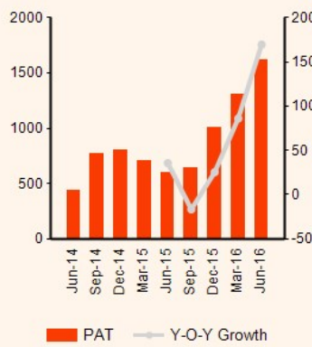
PAT and Y-O-Y Growth (Rs mn) (%)